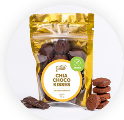
GLUTEN AND ALLERGEN FREE CHIA CHOCO KISSES