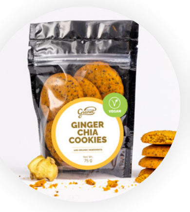
GLUTEN AND ALLERGEN FREE GINGER CHIA COOKIES