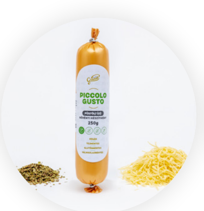
SMOKED FLAVOUR BLOCK (250 g)