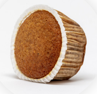
GLUTEN AND ALLERGEN FREE GOLDEN MUFFIN