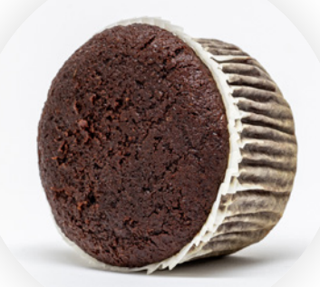
GLUTEN AND ALLERGEN FREE COCOA MUFFIN

SINGLE PACK/ DOUBLE PACK FOR PUBLIC CATERING