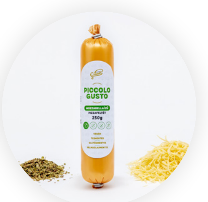
MOZZARELLA FLAVOUR PIZZA TOPPING (250 g)