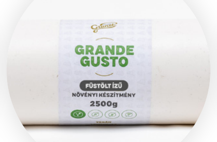
SMOKED FLAVOUR BLOCK (2500 g)