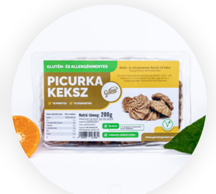
GLUTEN AND ALLERGEN FREE TEENY BISCUIT