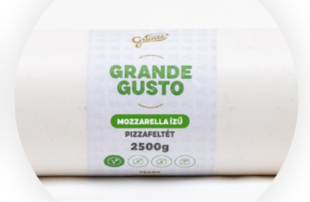
MOZZARELLA FLAVOUR PIZZA TOPPING (2500 g)