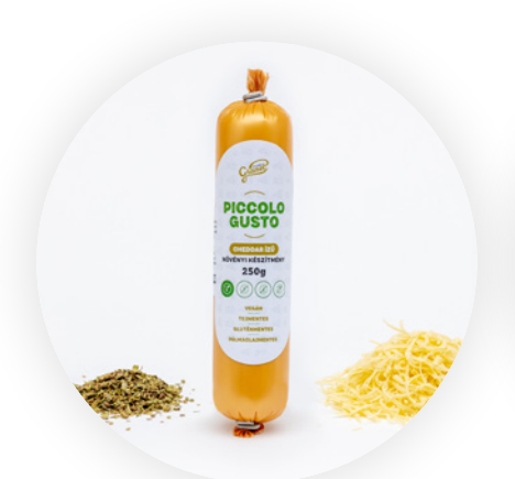
CHEDDAR FLAVOUR BLOCK (250 g)