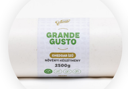
CHEDDAR FLAVOUR BLOCK (2500 g)